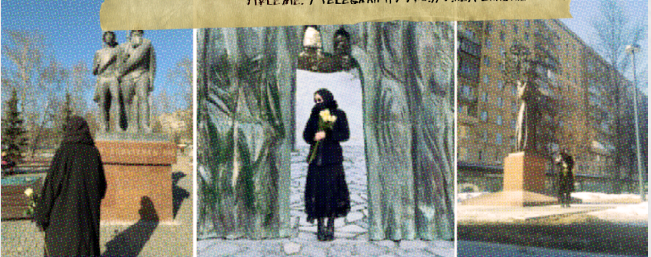
FIG. 2. RUSSIA 2022.

Nowadays, the silent action is directed against the war in Ukraine, as well as to mourn the victims of this horror (fig. 2). As the 'FAS' source instructs,